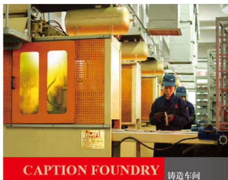
CAPTION FOUNDRY 铸造车间

Water meters and couplings Valves and fittings OEM Brass/Bronze/ Lead free parts ETP Copper Bus bar Brass/Bronze/ Lead free Ingots Brass/Bronze/ Lead free Rods Brass/Bronze/ Copper Coils/Strips Brass/Bronze/ Copper Sheets/Plates